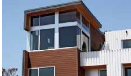
Private Residence | San Diego