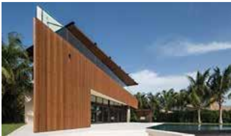
Private | Florida