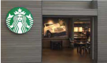
Coffee Shop | Brooklyn, NY

All its very exceptional properties make Resysta extremely resistant to weather influences like sun, rain, snow and ice, salt- and chlorine-water. Resysta does not swell, crack, splinter or rot. We provide a limited warranty up to 25 years in residential applications and up to 15 years for commercial.