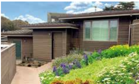
Country Club | Manhattan Beach