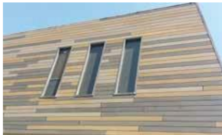
Office Complex | Monterey Park