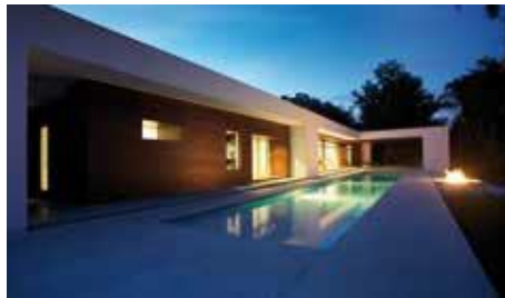
Lake House | Miami, FL